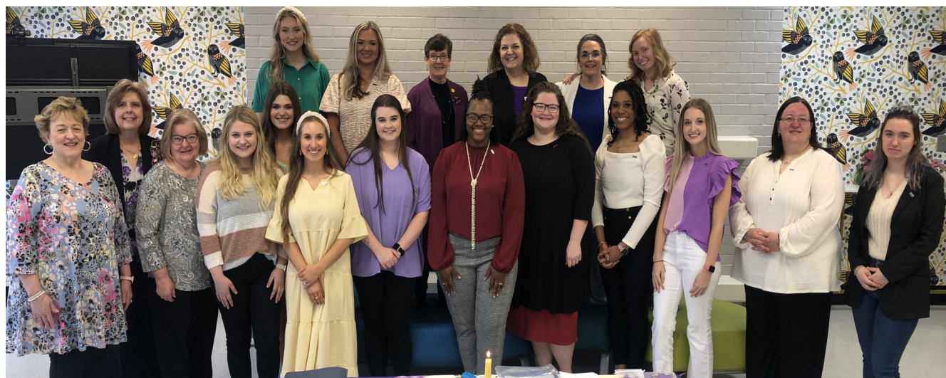
March 1, 2023 Initiation of Mississippi University for Women Campus/Collegiate Kappa Chapter members