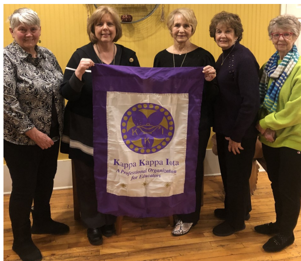
November 2022 Joint Meeting with Alpha Delta Chapter in Ripley, MS