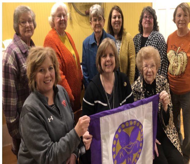
November 2022 Joint Meeting with Iota Chapter in Ripley, MS