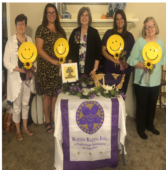
Installation of 2022-2023 Local Chapter Beta Officers in Columbus, MS