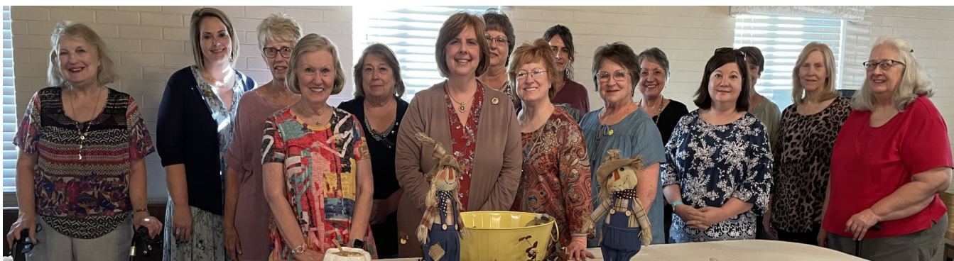
September 2022 Meeting with Rho Chapter Members in Brookhaven, MS