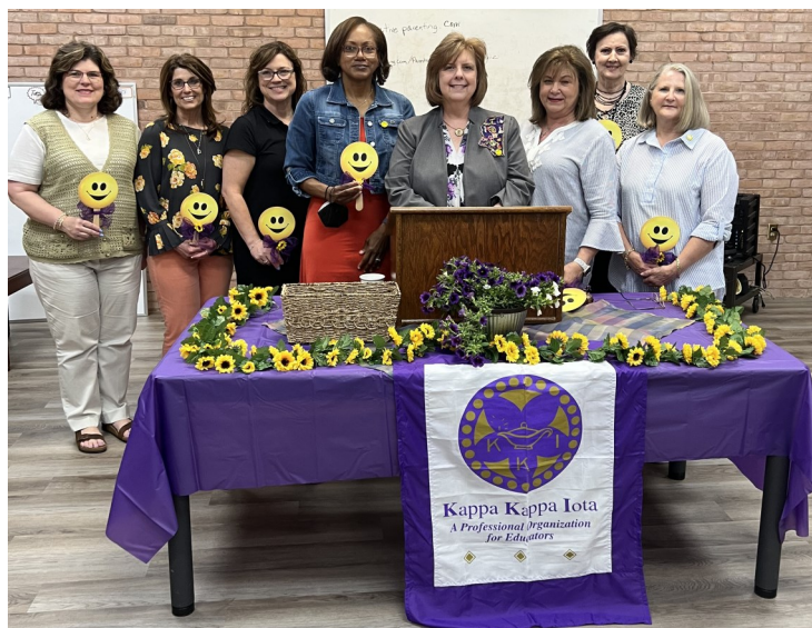
Installation of 2022-2023 Local Chapter Gamma Officers in Booneville, MS