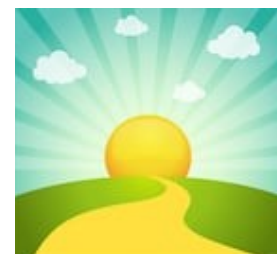
Kappas Create a Brighter Tomorrow