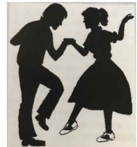
Twist and Shout for Kappa