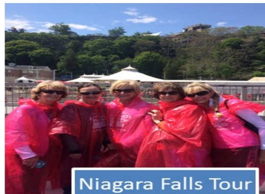
Niagara Falls Tour